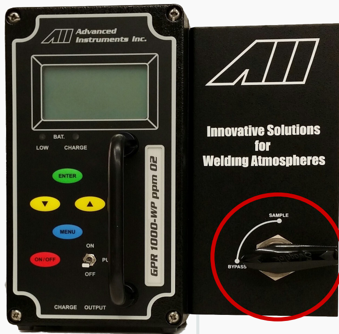
GPR-1000 WP Weld Purge Oxygen Analyzer