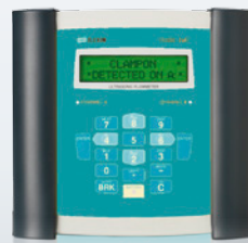
FLUXUS® G601 ST