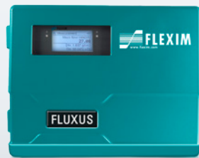
FLUXUS® G721 ST

More than 25 years of experience in non-invasive ultrasonic flow measurement