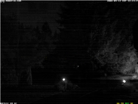
Security camera view (no LED emitter bar)