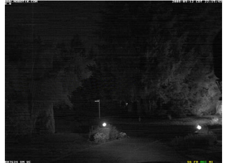
Security camera view with 8 LED IR light