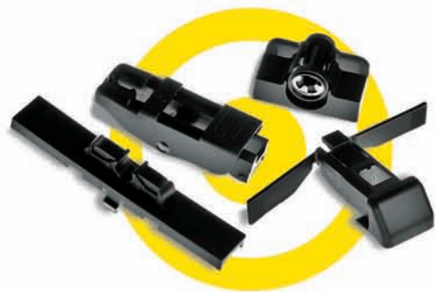
INCLUDES: Adapters with each PLATINUM SCRUBBLADE to cover over 99% of vehicles

AVAILABLE SIZES: 14"/ 15"/ 16"/ 17"/ 18"/ 19"/ 20"/ 21"/ 22"/ 24"/ 26"/ 28"