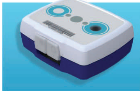
Smart Asset Tag

Each tag has a unique barcode readable ID number to assist inventory checking.