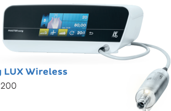
MASTERSurg LUX Wireless

Simple, intuitive programming, touchscreen, and wireless foot control make MASTERSurg a comfortable system to use while delivering maximum performance and safety. Easily customize up to 10 programs, each with 10 individually programmable steps.