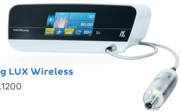
MASTERSurg LUX Wireless