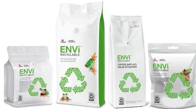
Available in M-seal, stand-up, flat bottom pouches & fractional packs.

Balancing sustainability with protection & appeal for the complete coffee package