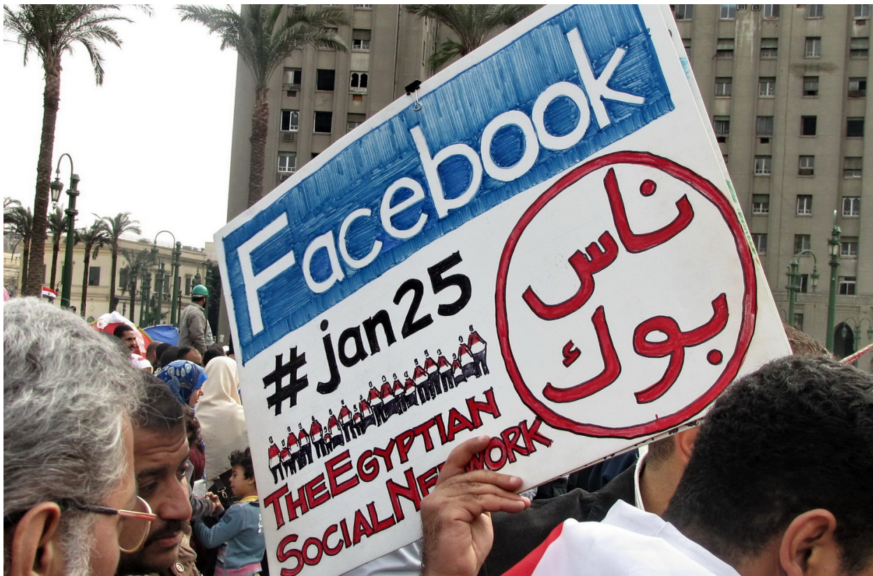
social media during the 2011 Egyptian Revolution.

Any revolution brings with it consequences in a short term but as historically established, it confirms the main focus on the individual as part of a free community, democratic and including minorities power. For this reason, making the way to vote easier is a crucial point to succeed and to affirm freedom in the world we are living.