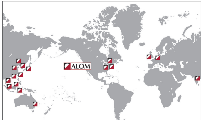
ALOM's 18 global locations are convenient to the world's industrial and consumer markets.