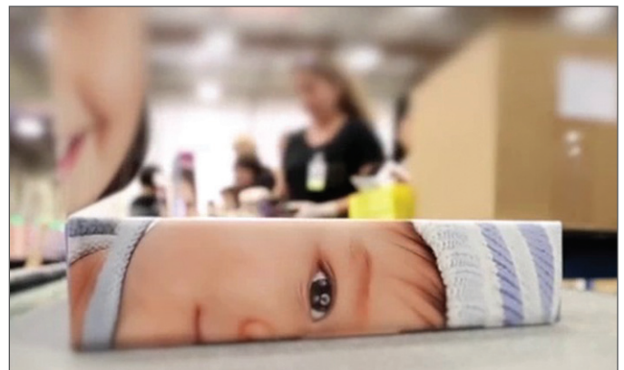
ALOM offers comprehensive, turnkey solutions for procurement, inventory management, kitting, assembly, fulfillment, retail replenishment, reverse logistics, and distribution.