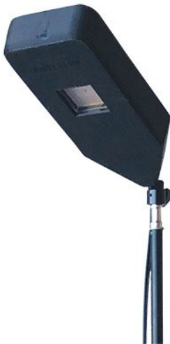
Krypton-Shield Floor Lamp