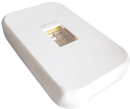
Krypton-36 Disinfection Light