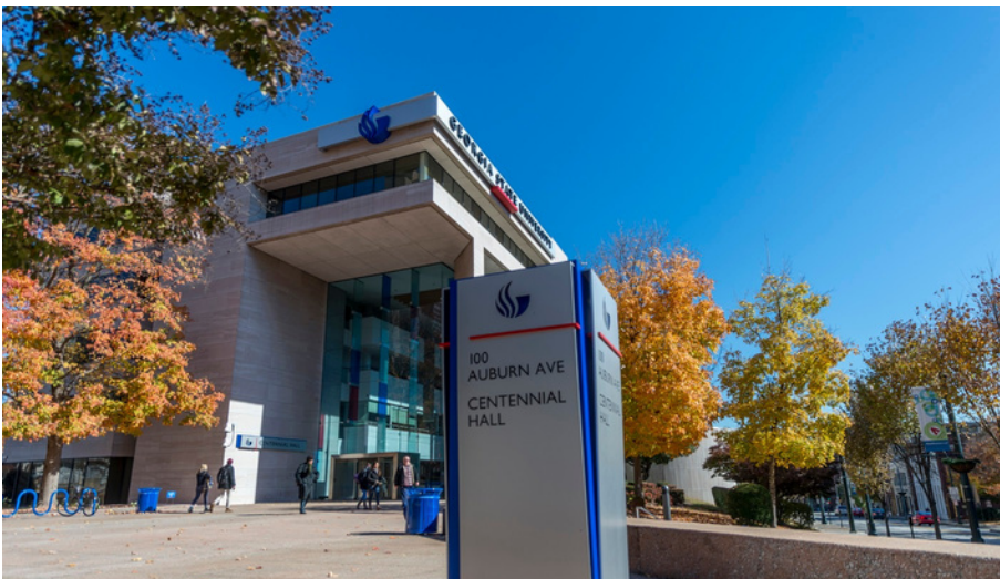
Georgia State University campus during the Fall Semester.