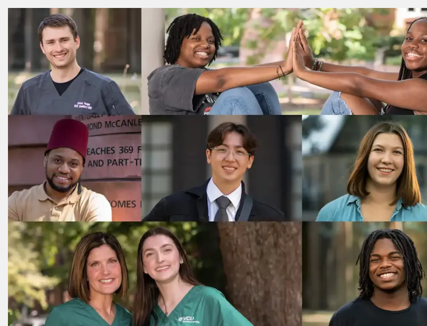
Sept. 13, 2023 Welcome to the Family