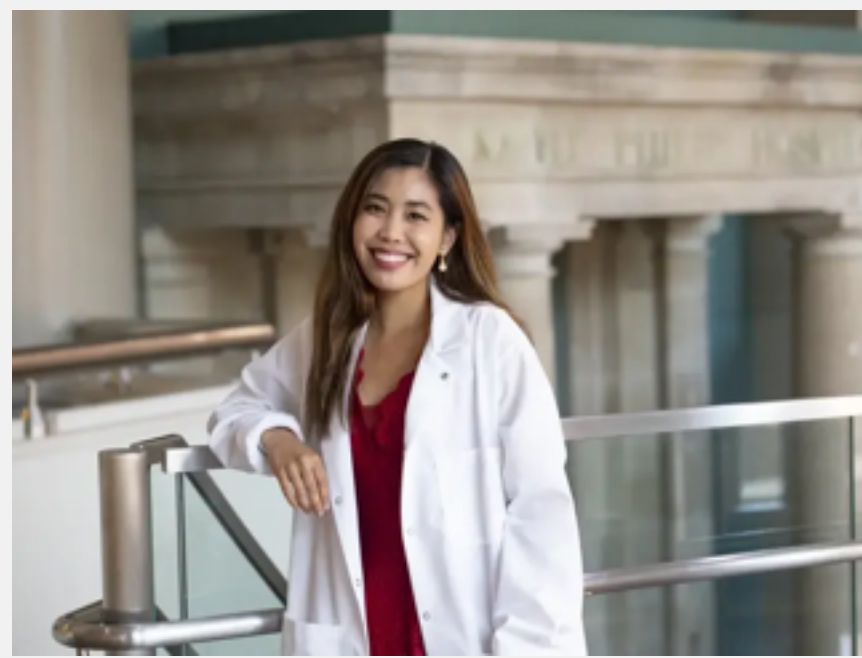
Sept. 5, 2023 With talent ranging from the lab to the stage, VCU senior sees a future in medicine and mental health advocacy