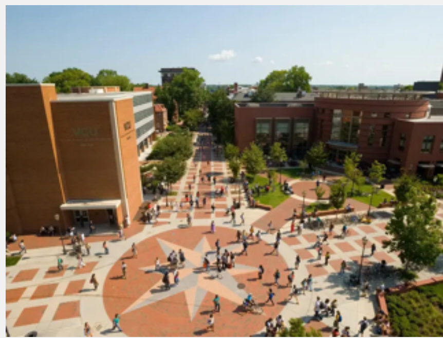
Aug. 31, 2023 Faculty Convocation will honor seven VCU educators and researchers for excellence