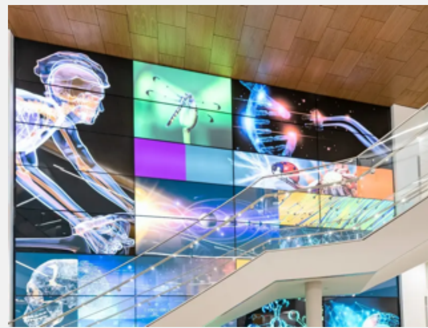
Sept. 7, 2023 What's new at VCU for 2023-24