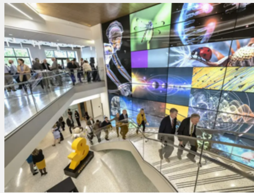
Sept. 1, 2023 Take a video tour of VCU's new STEM building on Franklin Street