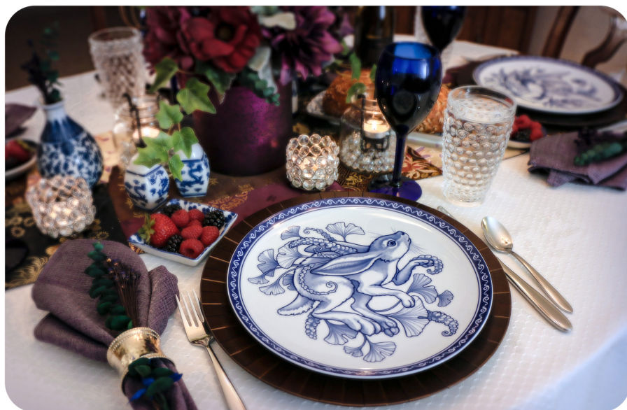
Wild Indigo 10.75" dinner plates with LilyKoi , GinkgoBunny , WheatFox , and FernSparrow designs by Jess Simmons. For high-resolution images, please see the Press Kit .