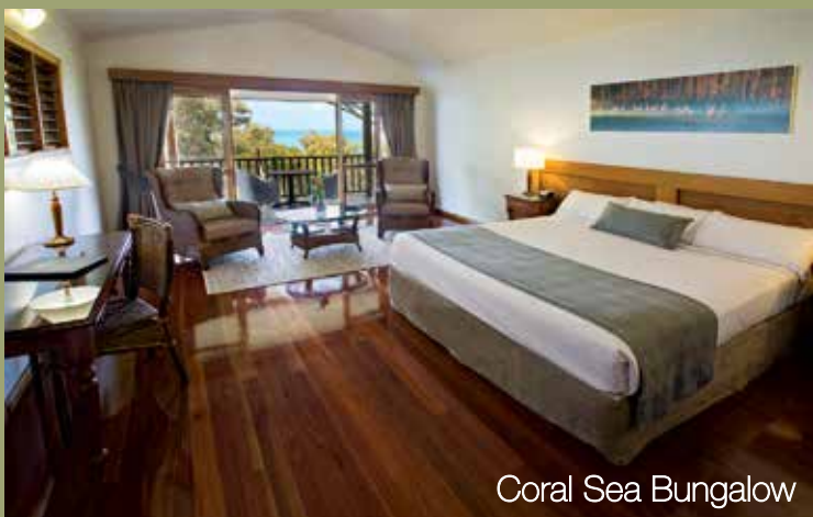
Coral Sea Bungalow

Jungle Walk Bungalows are low-set deep within the forest and capture the intimate feel of the unique woodland environment.