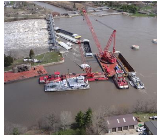
Salvage operations continue near Marseilles Dam

The Corps personnel provide immediate and effective all hazard response and recovery assistance to communities within their District and throughout the nation who are impacted by natural or man-made disasters. They ensure District emergency preparedness through flood system inspections, response teams and emergency equipment readiness, customer participation, and continuous planning and process improvements. Past District support includes emergency clearance of debris, restoration of critical public services and facilities, the deployment of flood fight supplies and technical assistance, structural evaluation of buildings, and damage assessment.