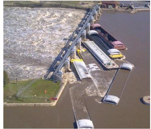
Barges collide with Marseilles Dam.

The inland waterway navigation system is essential to the economy of the Midwest and nation. Consequently, one of the Rock Island District's primary missions given to them by Congress is to maintain navigation and improve channels. The District operates and maintains 582 miles of nine-foot navigation channel and 20 locks and dams that allow for the safe and efficient transport of a wide variety of commodities. Each year, more than 90 million tons of cargo and more than 100,000 boats and barges pass through their locks on both the Mississippi River and Illinois rivers. Therefore, they devote nearly 70 percent of their resources and efforts to operating and maintaining the navigation system.