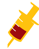
Vaccinations Including Flu Shots