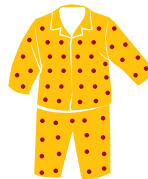
Children's Fire-retardant Pajamas