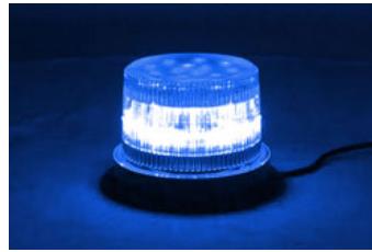
Click Images to Enlarge

This LED beacon has 30 flash patterns including four simulated rotating patterns. This unit also offers alternate or simultaneous flash patterns with up to eight connected LED beacons. This waterproof beacon has a black powder coated die cast base that contains a fully potted circuit board. A clear polycarbonate lens protects the LED assembly and the housing is waterproof, shock resistant and built for reliable and durable operation. This LED beacon draws only 0.12 amps on 120 volts and is universal voltage, operating on 120-277V AC.