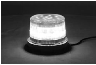
Click Images to Enlarge