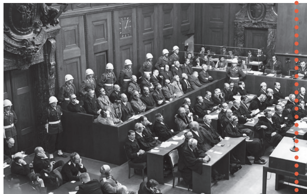
In 1945-46, the Nuremberg trials charged representatives of the Nazi party for criminal offenses in World War II. Today, the Memorium Nuremberg Trials, a Site of Conscience located at the historic venue, shares the background, conduct, and subsequent effects of the trials with the public.

FOR A SCHEDULE OF SPEAKERS AND PRESENTATIONS, PLEASE SEE NEXT PAGE.