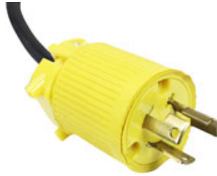
L5-15 Twist Lock Plug 15 Amp / 125V Rated