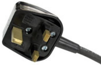
UK BS1363 Straight Blade Plug 13 Amp / 250V Rated / Internal Fuse