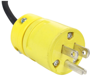
5-15 Straight Blade Plug 15 Amp / 125V Rated