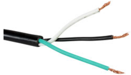
Flying Leads / Pigtail Wires

Wiring/Plug: This explosion proof LED light fixture is equipped with 25 feet of 16/3 chemical and abrasion resistant SOOW cord between the transformer and cord cap. The cord cap is an industrial grade cord cap for easy connection to common wall outlets. Plug options include standard 5-15 15 amp straight blade plug for 110V wall outlets with ground, standard 6-15 15 amp straight blade plug for 220-240V wall outlets with ground, NEMA L5-15 15 amp twist lock plug for 125V twist lock outlets, NEMA L6-15 15 amp twist lock plug for 240V twist lock outlets, British BS1363 13 amp fused 3-blade plug for United Kingdom outlets, or a two pin 16 amp rated Schuko plug with ground contact and socket for European outlets up to 250V. Alternatively, we can provide flying leads with no plug for hard wire applications or for operators who prefer to wire in user provided cord caps. Please choose pigtail option below for flying leads with no plug.