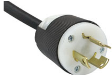
L6-15 Twist Lock Plug 15 Amp / 250V Rated