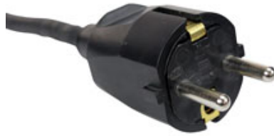
Intl Schuko 2-Pin Plug 16 Amp / 250V Rated / Grounded