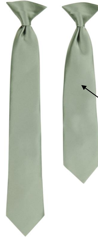
BOY'S TIES – Available in 11" & 14"