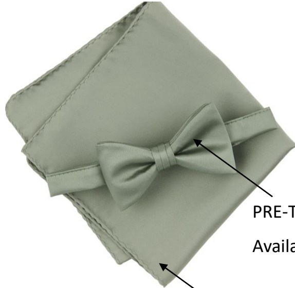
PRE-TIED BOW TIES – Available in Men's & Boy's