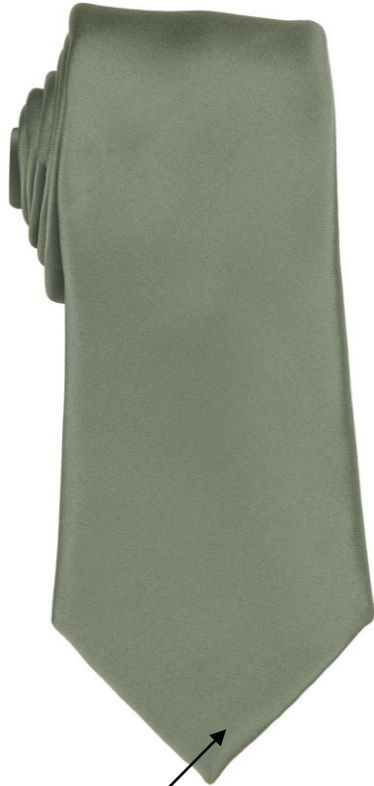
MEN'S TIES – Available in 58"(L) & 63"(XL)

13 colors in matching sets, finished with stain resistance .