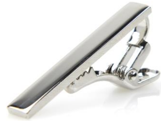
TIE BARS – Available in 1" & 1.5"