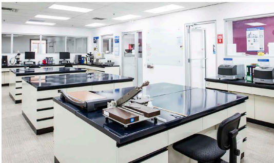
Analytical Lab / Calgary, Canada Scientific Perspective

From pioneering new structures to texturizing brands designs, our integrated Innovation Center combines each core area of expertise needed to tailor your packaging precisely to your specifications.