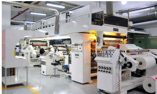
Converting Facility / Incheon, South Korea Converting Perspective