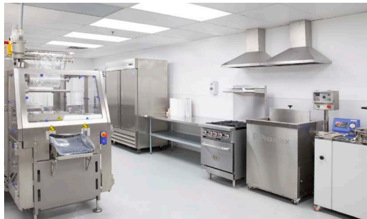
Application Lab / Calgary, Canada End-User Perspective