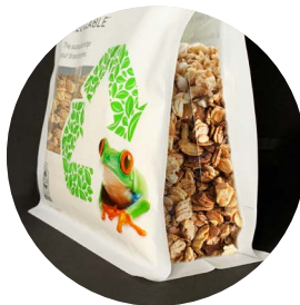
Clear side gussets