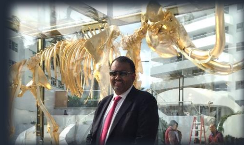
Golden Mammoth, Faena Hotel Miami, FL