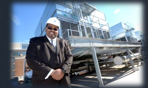
Cooling Tower Replacements, Philadelphia