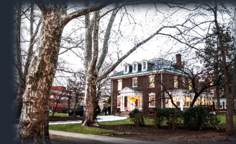
Corporate Headquarters, Philadelphia Navy Yard