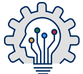
Technology & Innovation